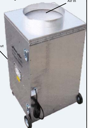
"Narrow footprint", Vertical Configuration

100 lb. canister of granular carbon, no HEPA