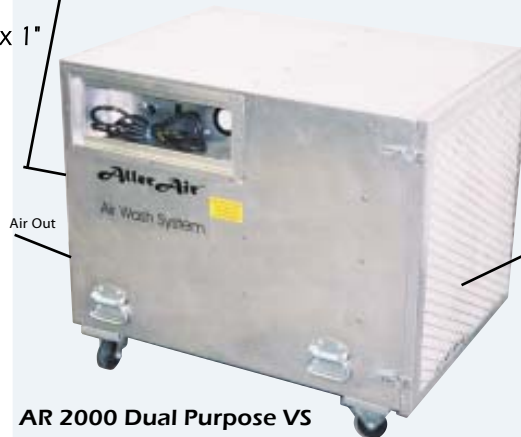
AR 2000 Dual Purpose VS